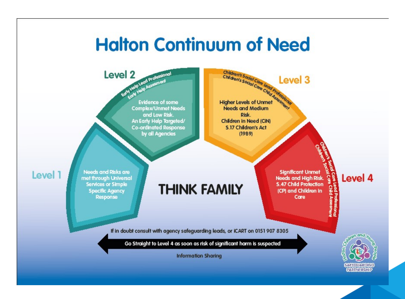
Appendix B – Halton's Continuum of Need Framework

All staff should be aware that child sexual and child criminal exploitation are forms of child abuse.